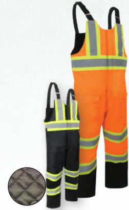
70-546RP P. 28