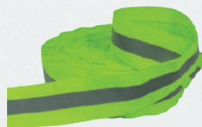
BR-001 P. 34