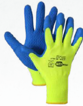
90-452 P. 31