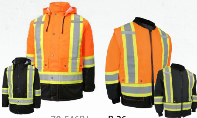
70-546RJ P. 26