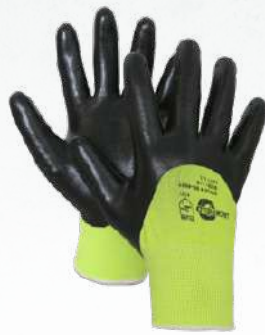
90-455 P. 31