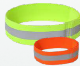
70-152 P. 33