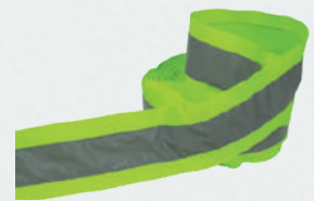
BRE-002 P. 34