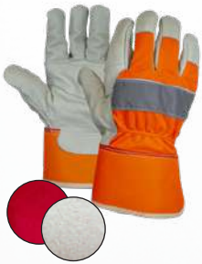
90-075D P. 32