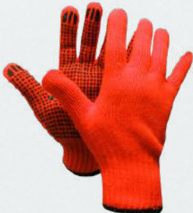
50-902 P. 30