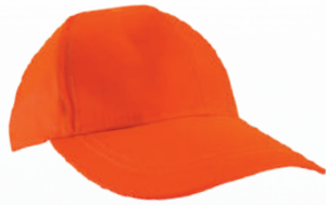
30-909 P. 29