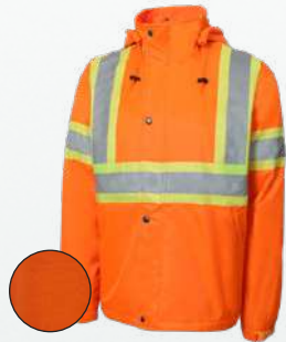
70-532R P. 20