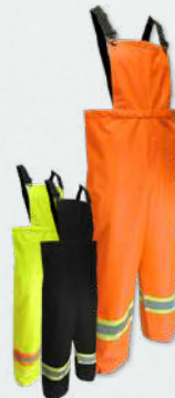
80-202J / 80-202P P. 27