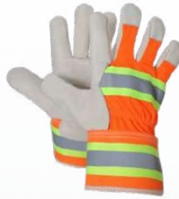
90-049 P. 32