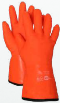
90-461 P. 33