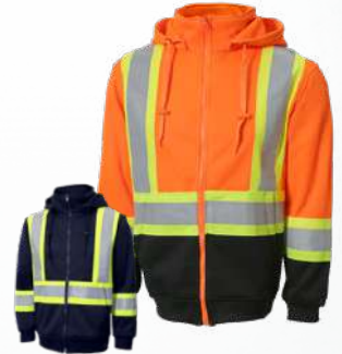
70-713R P. 19