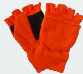
2504 P. 30