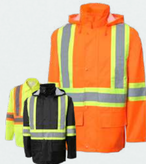
80-204J / 80-204P P. 24