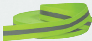
BRE-000 P. 34