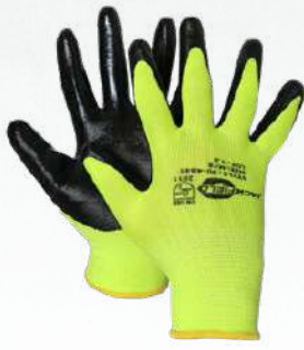
90-484 P. 31