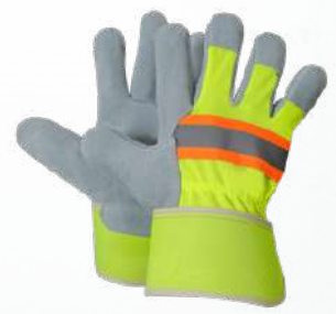
90-010 P. 32