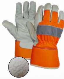
90-075M P. 32