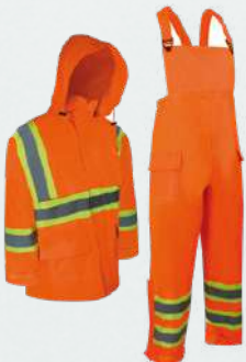
80-201R P. 23