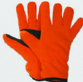
50-908 P. 30