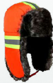
30-944 P. 30