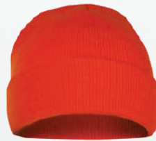
30-915 P. 29