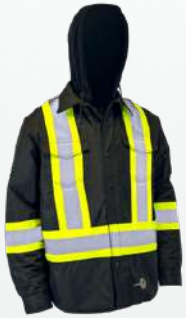
70-554R P. 20