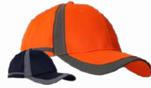
30-219 P. 29