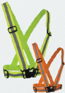
70-940 P. 34