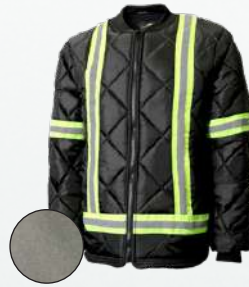
590R P. 21