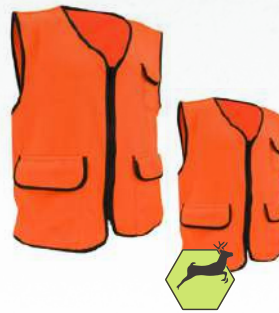
20-002 / 23-002 p.4