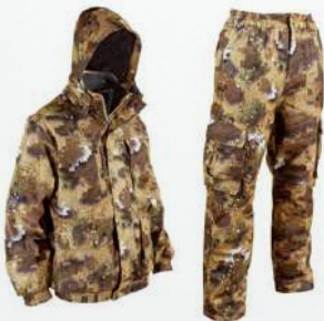
20-233 / 20-071 p.17