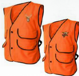
346DEE / 346MOO p.3