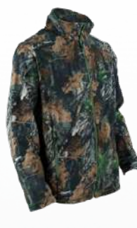
20-775 / 20-075 p.15