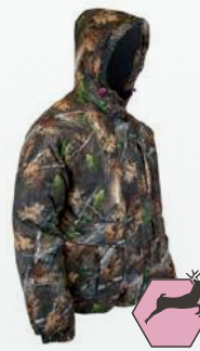
21-247 / 21-047 p.19