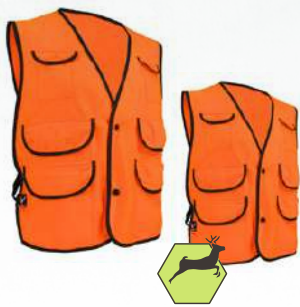
346 / 346JR p.2