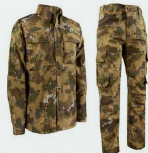
20-270 / 20-070 p.11