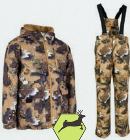
23-232 / 23-032 p.21