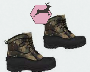
60-502 /61-502 p.35