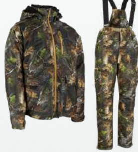
20-272 / 20-072 p.18