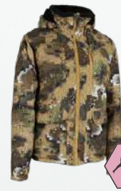
21-273 / 21-073 p.20