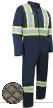
# 70-311R P. 18 # 70-311RT