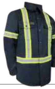
# 70-201R P.5