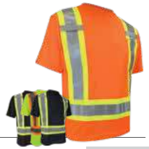
# 10-662R P.6