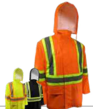
# 80-204J P. 26