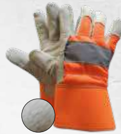
# 90-075M P. 33