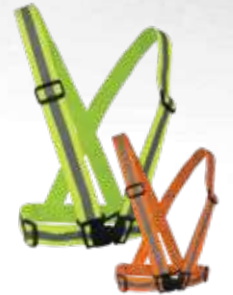
# 70-940 P. 34