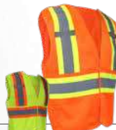
# 70-131 P.11