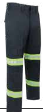
# 70-053R P.11