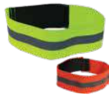
# 70-150 P. 34