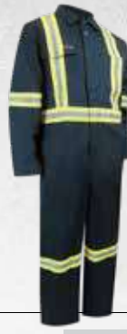
# 70-301R P. 15 # 70-301RT