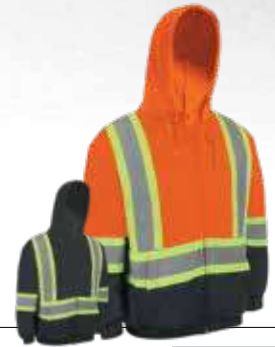
# 70-713R P. 20