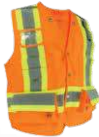
# 70-119 P.8