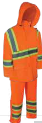
# 80-201R P. 25