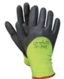
# 90-455 P. 32