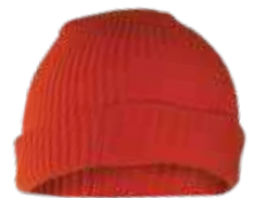
# 30-901 P. 30