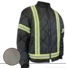
# 590R P. 22