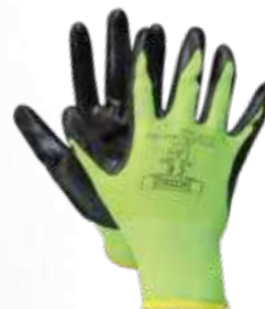
#90-484 P. 32