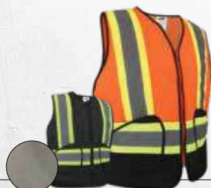
# 70-225R P.10