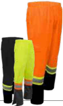
# 70-047R P. 20