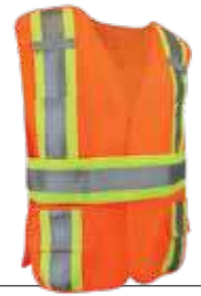
# 70-118 P.9