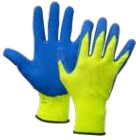
#90-452 P. 32