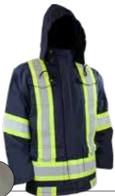
# 70-510R P. 23