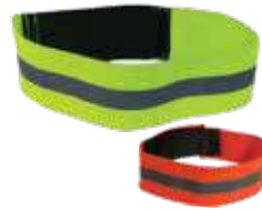
# 70-152 P. 34