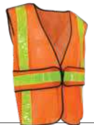
# 70-105 P.7