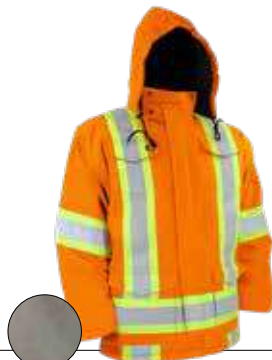
# 70-510RO P. 24