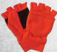
# 2504 P. 31