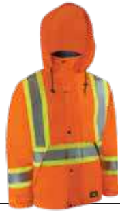
# 80-202J P. 27