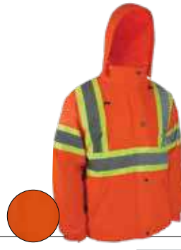
# 70-532R P. 21