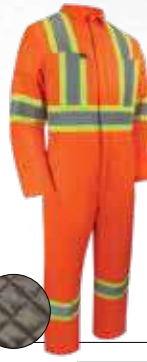
# 70-311RO P. 19 # 70-311ROT