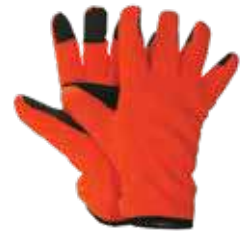
# 50-908 P. 31