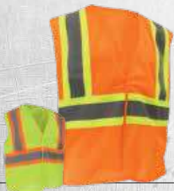
# 70-127 P.10