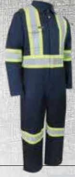
# 70-305R4 P. 16 # 70-305RT4