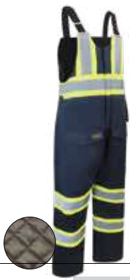
# 70-350R P. 12