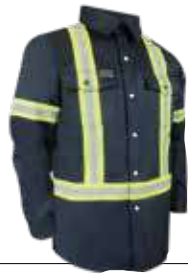
# 70-200R P.4