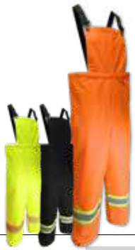
# 80-204P P. 26