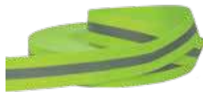
# BRE-000 P. 35