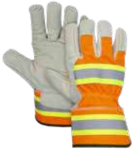
#90-049 P. 33