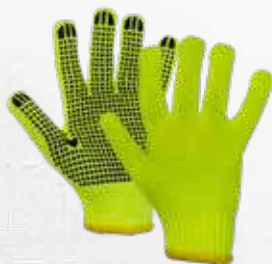
# 90-305 P. 32