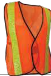
# 70-103 P.7