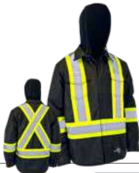
# 70-554R P. 21