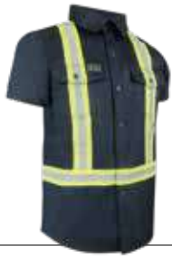
# 70-211R P.4