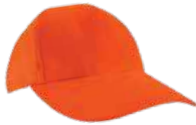
# 30-909 P. 30