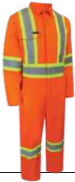
# 70-301RO P. 17 # 70-301ROT