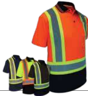
# 10-701R P.7