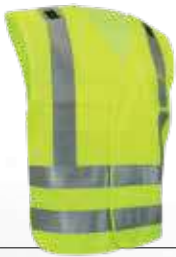
# 70-115 P.8