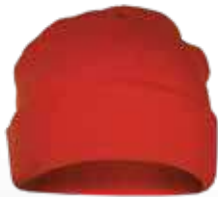
# 30-915 P. 30