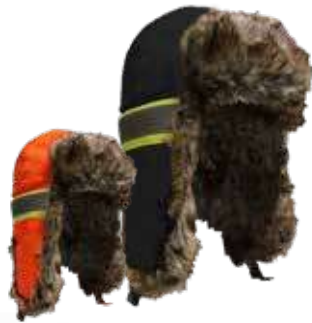
# 30-944 P. 31