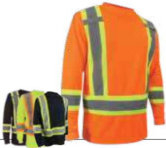
# 10-665R P.6