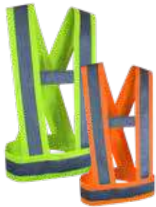
# 70-943 P. 35 # 70-943-O/S