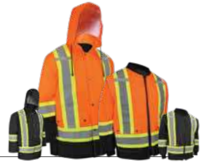
# 70-546RJ P. 28