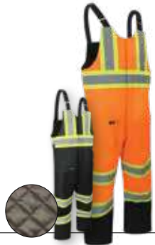
# 70-546RP P. 29