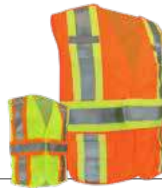
# 70-117 P.9