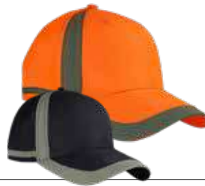
# 30-219 P. 30