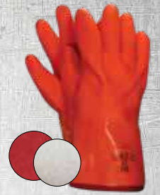
#90-461 P. 33