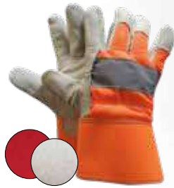
# 90-075D P. 33