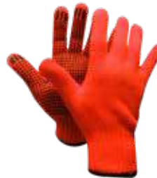
# 50-902 P. 31