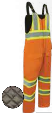
# 70-350RO P. 13