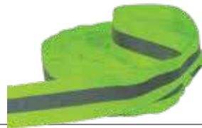
# BR-001 P. 35